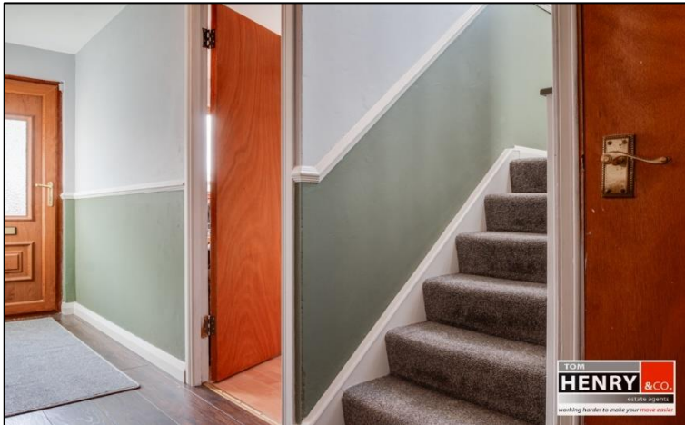
STAIRS & LANDING: CARPET. FEATURE WINDOW TO HALF TURN IN STAIRWELL. DADO RAIL. HOTPRESS: SHELVED.