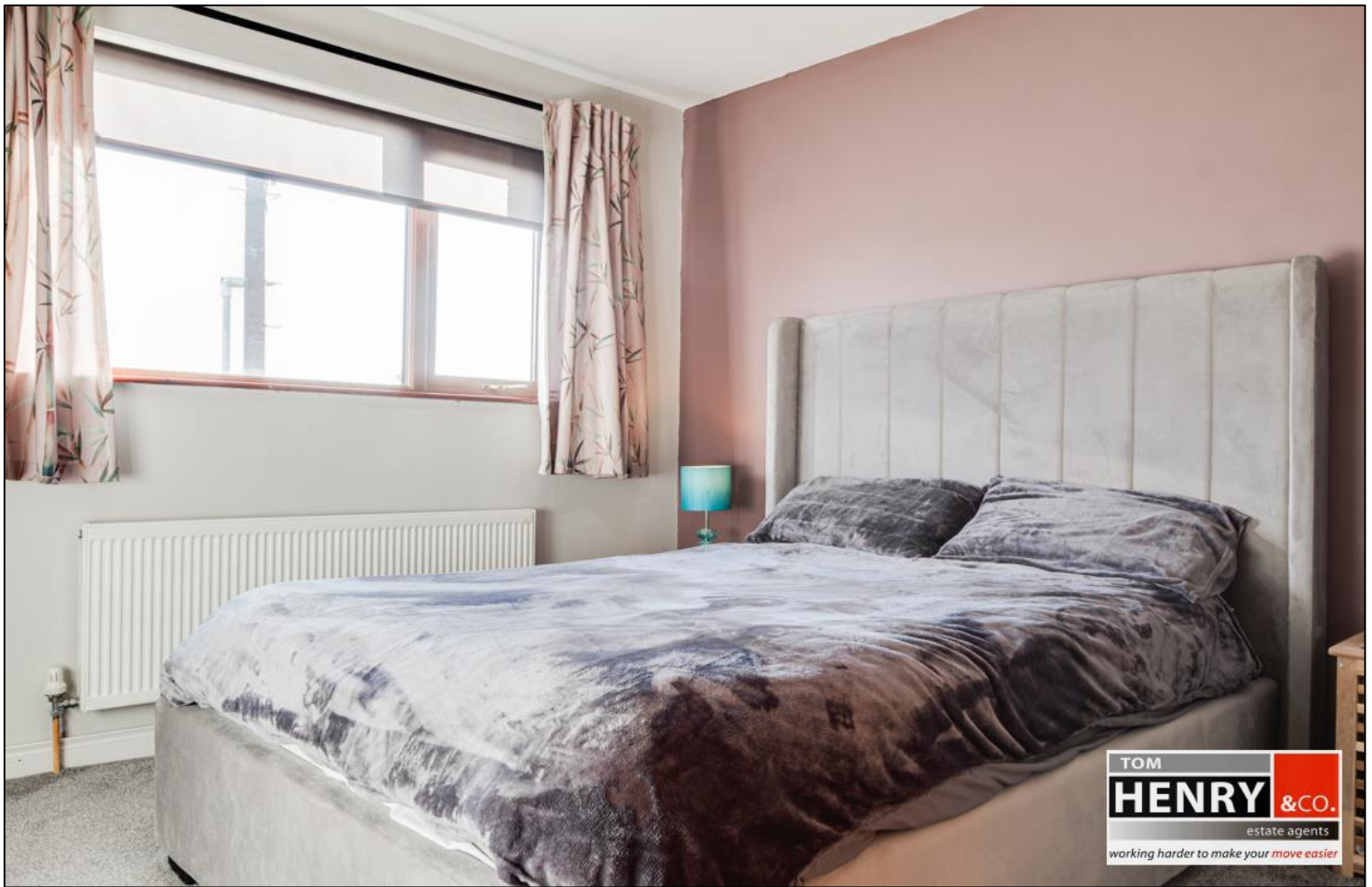
BEDROOM 2: TO FRONT. BUILT-IN CUPBOARD. PRE-FINISHED FLOOR.